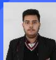
YUG MADAN 90.8%